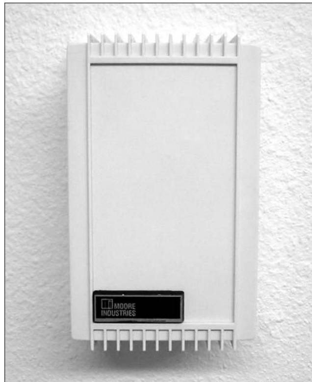
The T2X-DWB mounts directly to a wall for quick and easy installation.